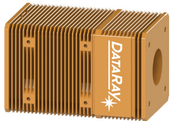
WinCamD-QD-1550 66 x 66 x 99 mm