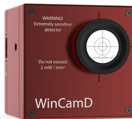
WinCamD-IR-BB 2.8 x 2.8 x 2.0"