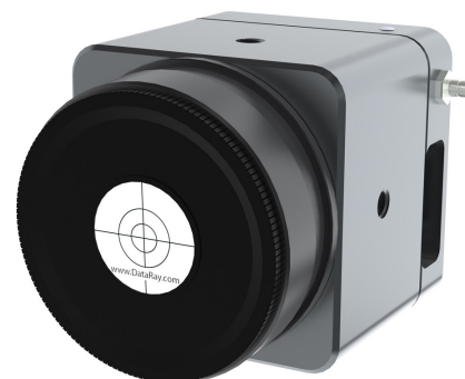
TaperCamD-LCM 2.25 x 2.25 x 2.13"

The TaperCamD-LCM is paired with DataRay's full-featured, highly customizable, user-centric software (which has no license fees, unlimited installations, and free software updates). It is perfect for applications including: CW and pulsed laser profiling; field servicing of laser systems; optical assembly; instrument alignment; beam wander and logging; R&D; OEM integration; and quality control.